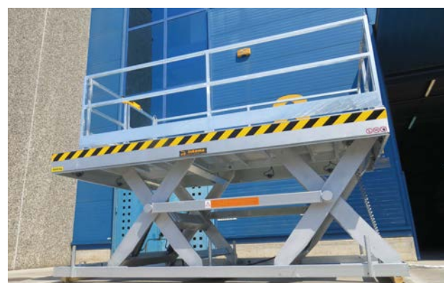
Galvanised Tandem Double Scissor Lift Table with side handrails and hinged doors with interlock.