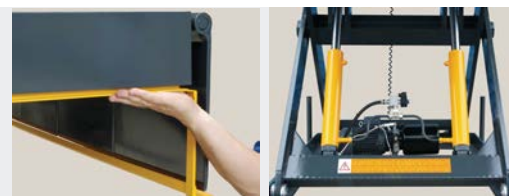
Perimeter foot barrier system Anti-fall safety valve