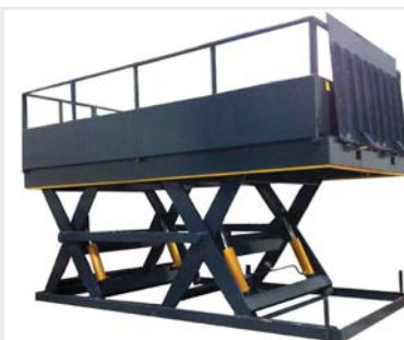
Tandem Double Scissor Table with side handrails, hinged doors and a hydraulic collapsible lip.