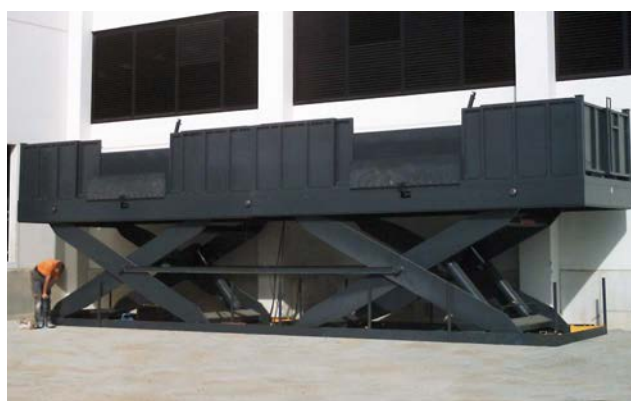
Tandem Double Scissor Lift Table with handrails, hinged doors and side claws.