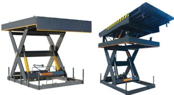
Single Scissor Lift Table (MEX1)